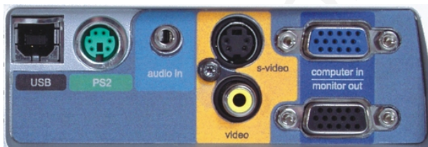
The ImagePro8753 inputs are easily accessible. Connecting your computer is quick and easy.

The Dukane ImagePro 8753A™ is a full-featured multimedia projector, which employs the latest LCD technology to produce vibrant saturated color images. Using XGA native resolution of 1024 x 768 pixels it will display virtually any computer or video image. With a light output of 1300 ANSI lumens and a contrast of 400:1, the image is clearly visible in classrooms and offices. This projector is an exceptional value while still providing easy operation in schools and business locations. It has simple controls, is ultra quiet, can be ceiling or table mounted, has digital keystone correction, operates with automatic image